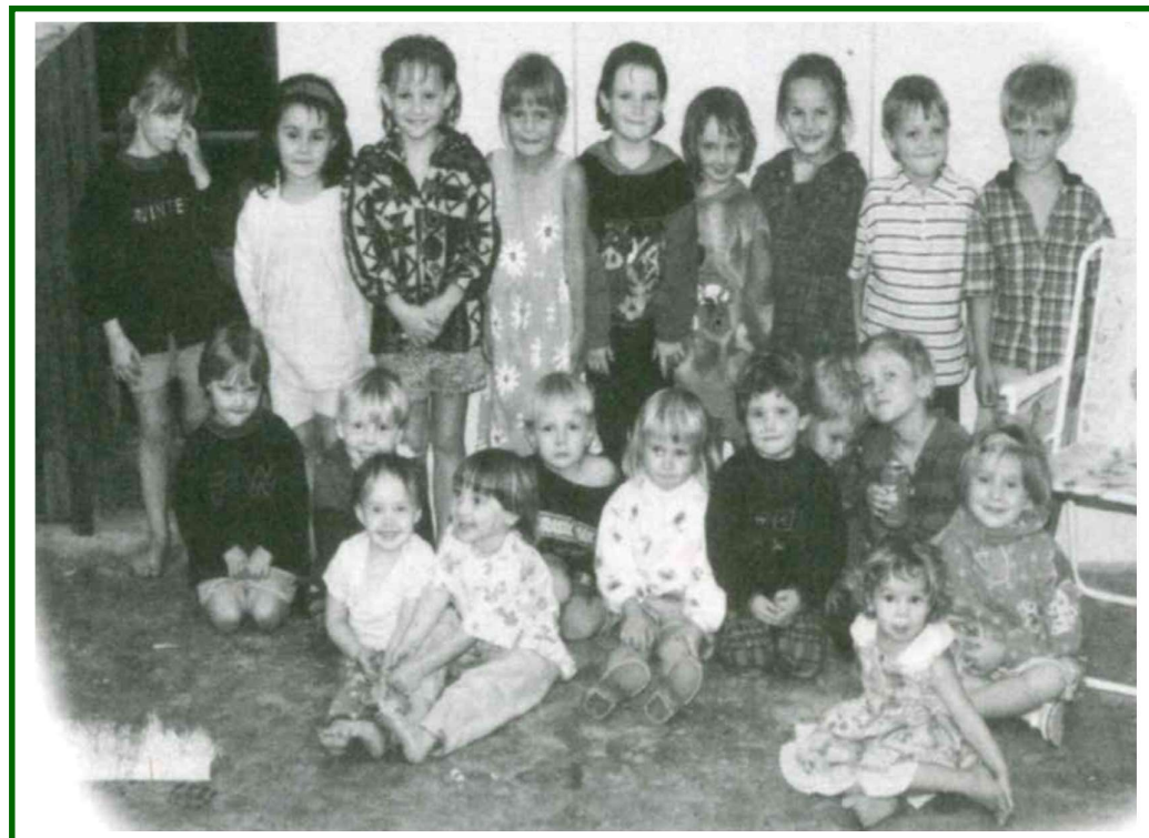
Riverview Preparatory School's first Pre-school class in 1997