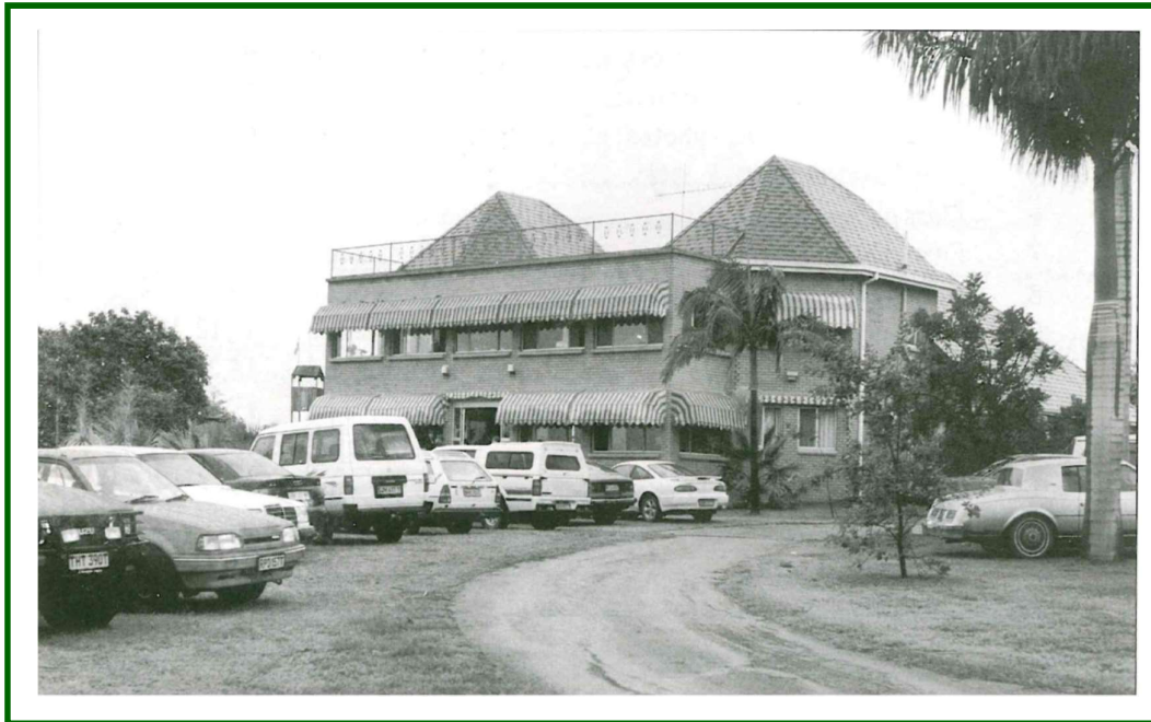
The Balcomb's residence at Tulloh Farms which was used as the first classrooms.